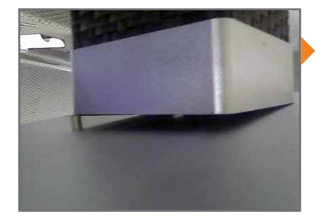
Take the base plate and position the rod through the centre. Make sure that the guide screws are INSIDE the woven leg. You may need two people for this: one to hold the base and the other to guide the 2 directional screws into the woven leg.