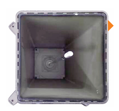
This is the view from the top after you have placed the woven leg. Note that the rod is straight up.