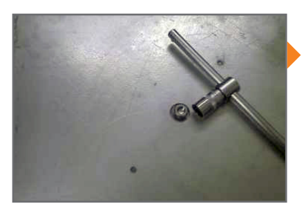
Once the base is in place, tighten the screw. You can use a tool like the one on the right as it will be easier to tighten the nuts.