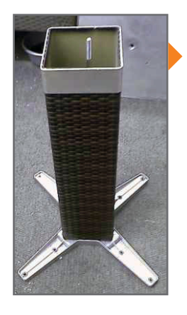
Place the cross on the ground and place the woven leg on the cross. It will not be held together by any protruding screws.