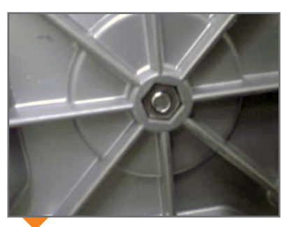
The pics above show the screws to be tightened. Please ensure that the rod does not protrude too much off of the end of the cross. Take note of the directions to mount the rod in as illustrated above.