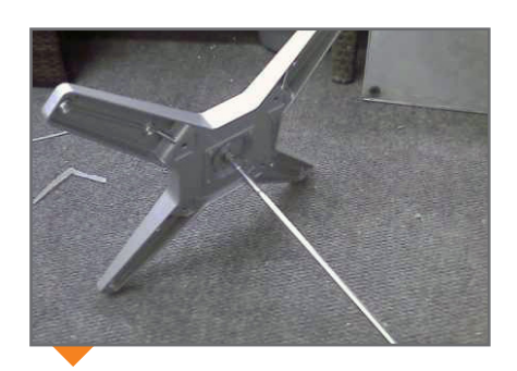
Connect the rod with two screws and washers to the cross. Ensure that they are very tight.